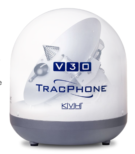
To learn more, visit kyh.com/V30comm

This 37 cm (14.5") D digital VSAT system provides high-speed connectivity, outstanding reception with improved signal efficiency, and high-performance tracking and stabilization designed for the roughest seas. Its single-cable, DC-powered design makes TracPhone V30 easy and fast to install. Plus, it includes KVH's Multi-level Cybersecurity Program as standard. Bring the best onboard with KVH, the No.1 maritime VSAT communications provider.*